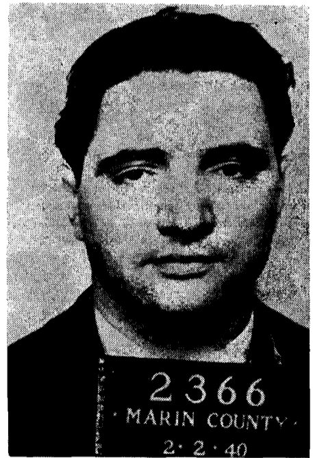
Or this one from the Marin County Sheriff's Office?

Which is the TRUE picture of Richard Nixon's Running Mate?