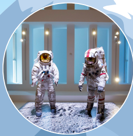
Apollo 11 Astronauts