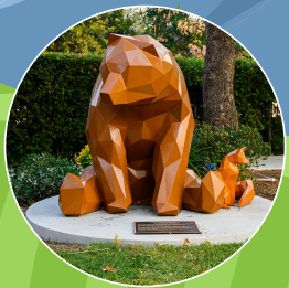
California Grizzly Bear