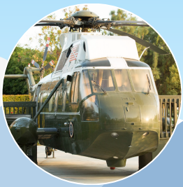
President Nixon's Helicopter

Find the items below throughout the library