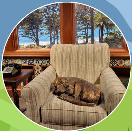
The Nixon Family Dog King Timahoe