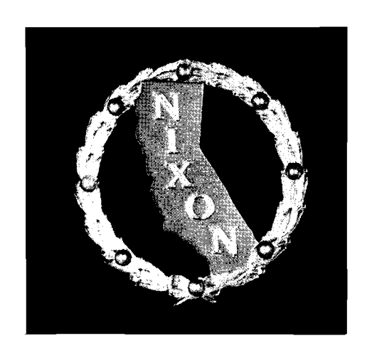
NIXON "STATE" PIN $1.00 gold plate with pearls or rhodium plate with rhinestones