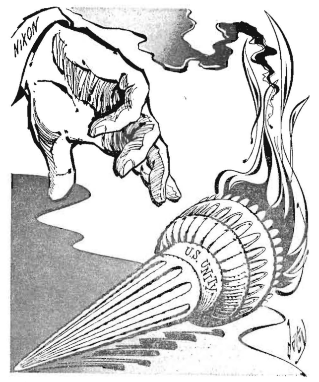
A Man With Grasp

to support the election of their party's nominee. There is little reason to believe that their opposition and reticence now will change to enthusiasm and support if he is elected. Since 1966 we have had too much of the paralytic effects of a hopelessly divided party in power to wish for more of the same.