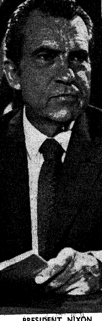
PRESIDENT NIXON ... addresses the nation