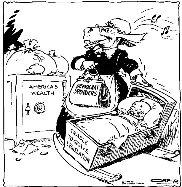
THE KINDLY AUNT AND THE POOR LITTLE RICH BOY