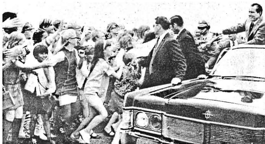
ADORATION is the theme when Orange County's young set rush to greet their new leader during his initial post-election visit to his native stamping grounds.